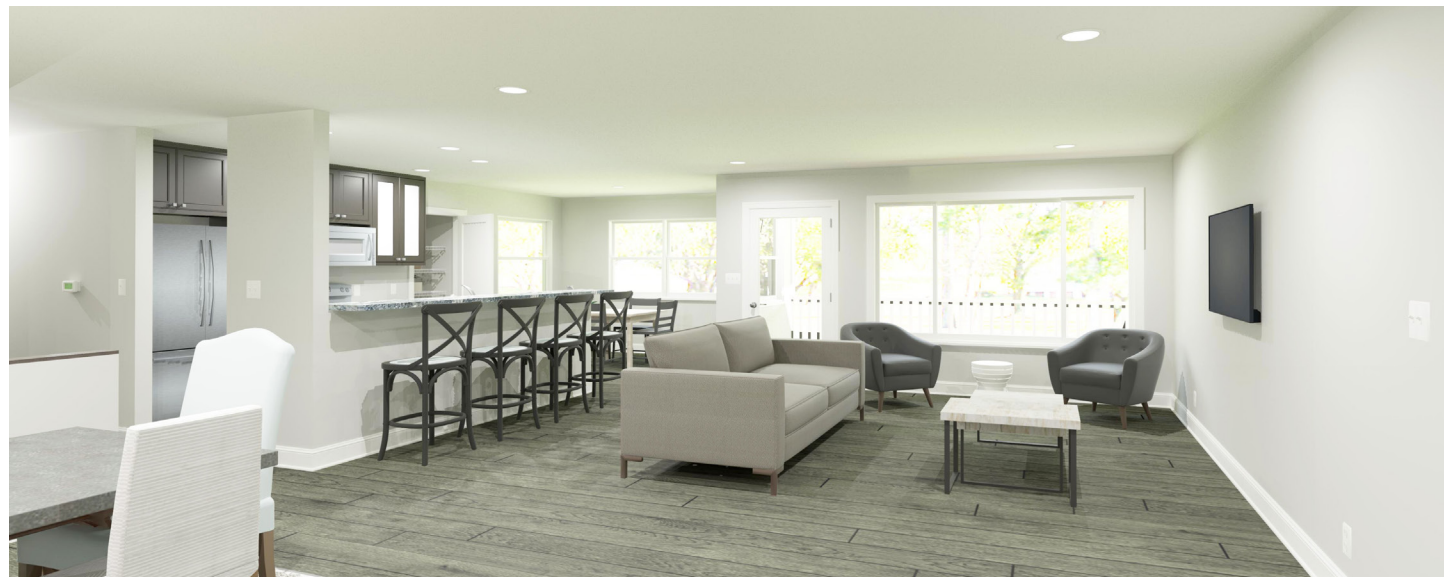
Kitchen & Dining