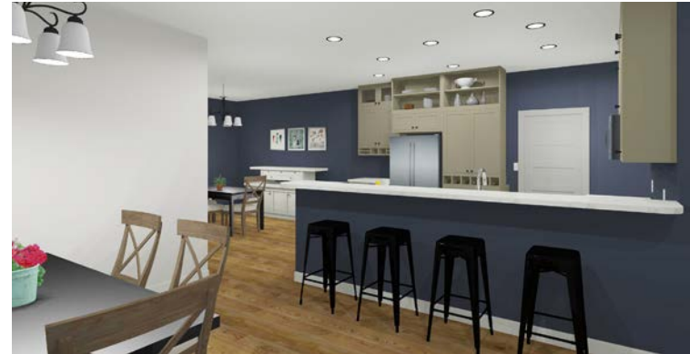
Dining & Kitchen