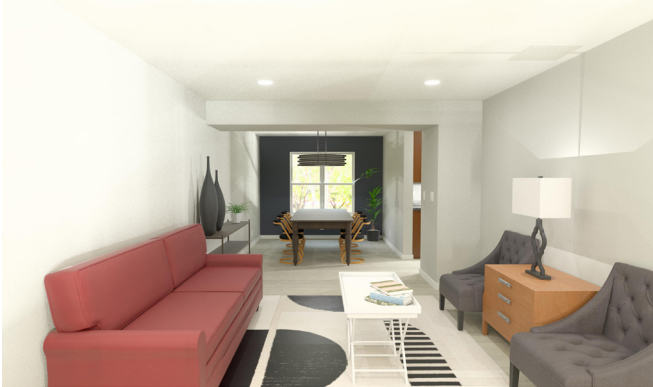
Living & Dining Room