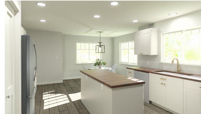
Kitchen & Breakfast Nook