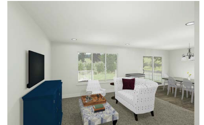
Living & Dining Room

The Seattle offers luxury and practicality. The expansive entry welcomes you into the home. The large kitchen is filled with cabinets and an island. The dinette is enlarged with a double cantilever window for an incredible view. The living room has a formal dining area which opens to a rear deck. The master bedroom is expanded with a bath and walk-in closet. The U-shaped stairway opens to the lower level and the garage is moved forward to allow for a workshop area or extra storage.