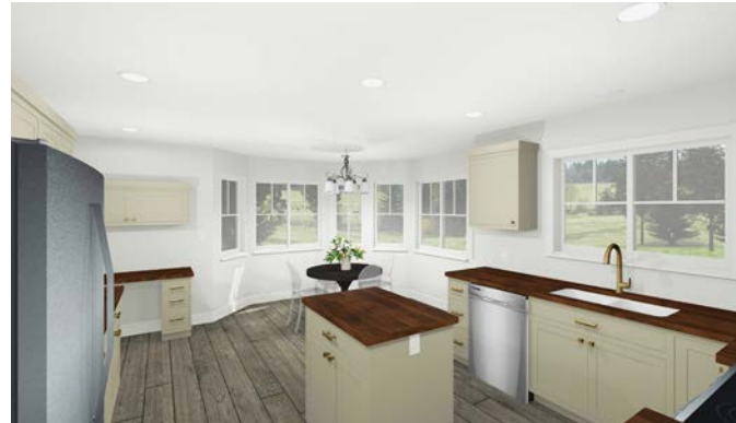
Kitchen & Breakfast Nook