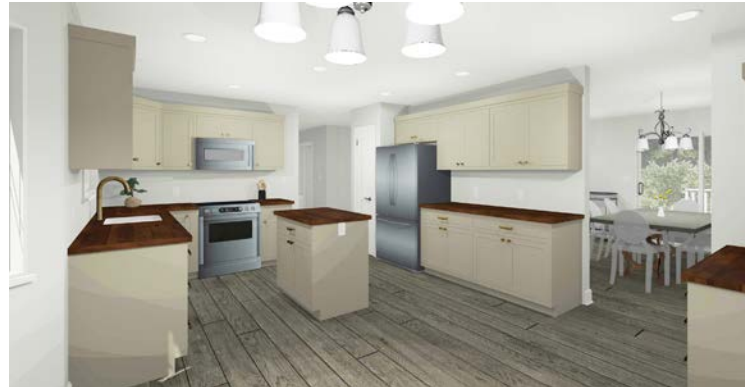
Kitchen & Dining Room