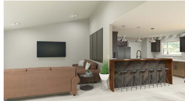
Living Room & Kitchen