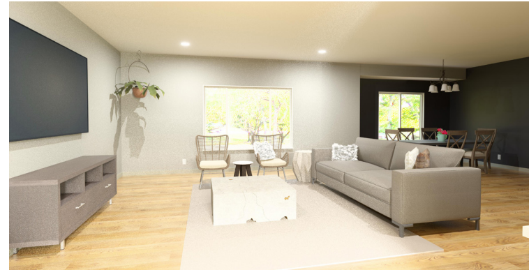
Dining & Living