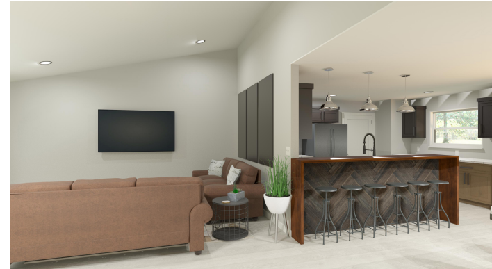
Living Room & Kitchen