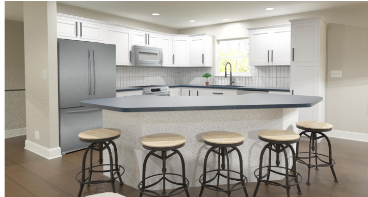
Kitchen & Dining