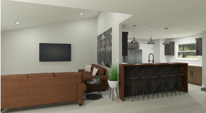
Living Room & Kitchen