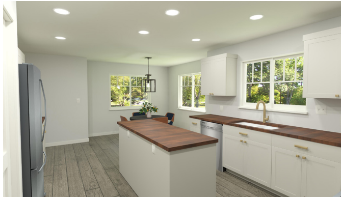
Kitchen & Breakfast Nook