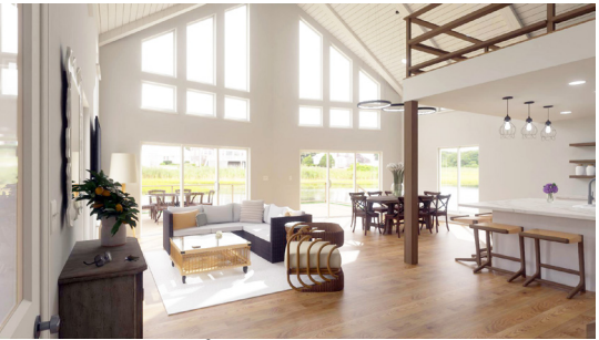
Living & Loft

Plans and elevations are artist's conceptions and may vary from standard plans. Homestead Homes of America, Inc. reserves the right to modify plans and designs without notice. RV 12/25